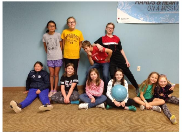
4 th – 6 th Grade Bible late night! October 18, 2019

All ages are welcome! There is something for EVERYONE to do!