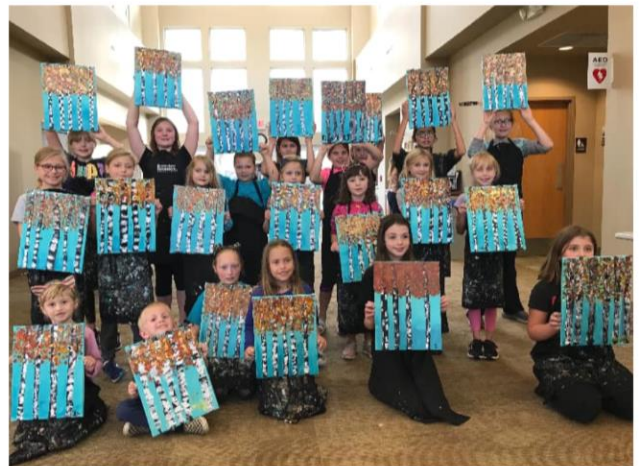
Annual Fall Youth Painting Party October 19, 2019 GREAT JOB EVERYONE!