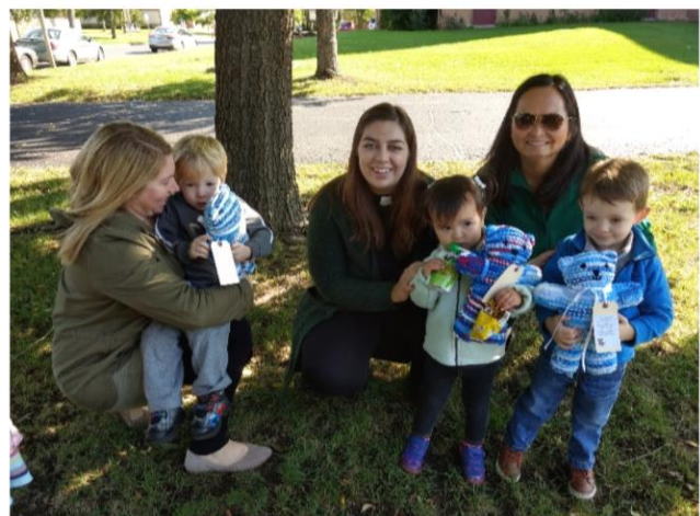
2-year old Prayer Bear Blessing October 6, 2019