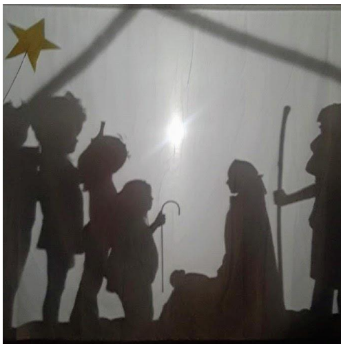
Sunday School Christmas Program