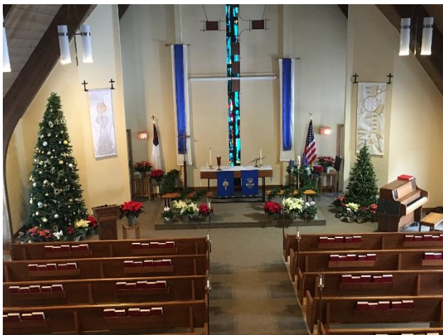
Christmas Eve Sanctuary