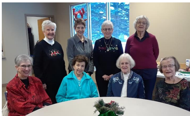
Joy Circle Christmas Party